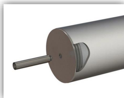
Fig.3 Blasting Plug Mini removal tool