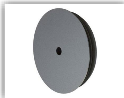
Fig.1 Blasting Plug mini