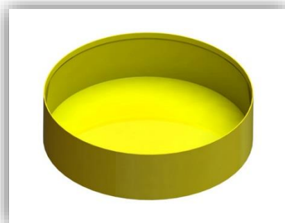
Fig.1 Flexible Pipe Cap