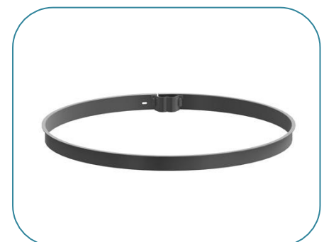
Fig. 2 Reusable Bevel Protector with Clamping Clip