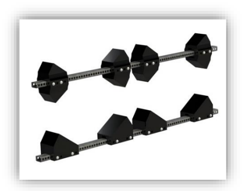
Fig.1 System88 base and mid-section